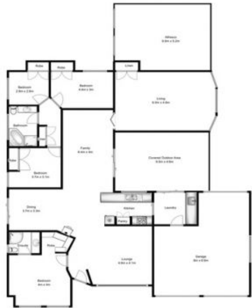
33 Mylora Street Hill Top Total Approx. Floor Area 378.3 SQ.M

Open2view used the best endeavors to make the information on this floor plan accurate and true. Unit area if shown are approximate only.